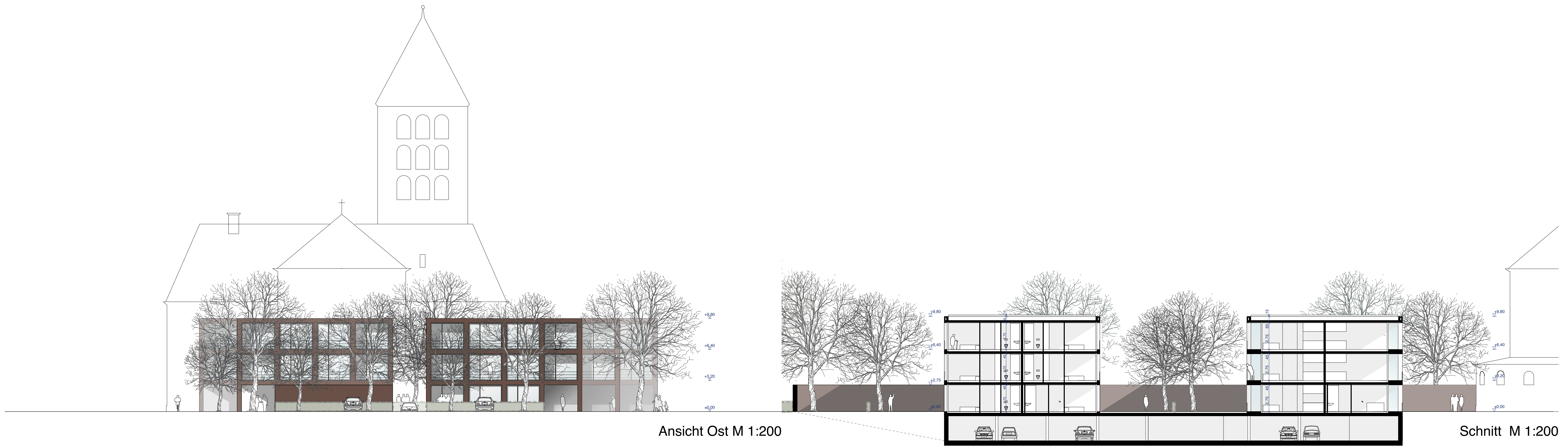
Ansicht Ost M 1:200